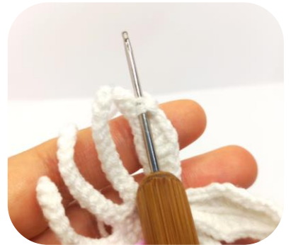
R 04 : 1 st side on the main chain