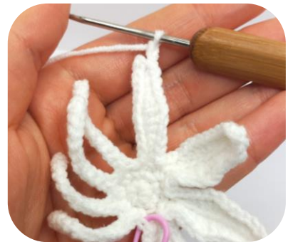
R 04 : 2 chains