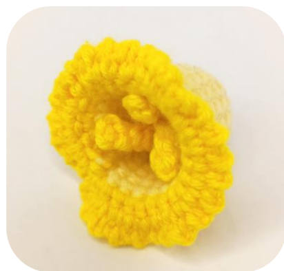
Sewing the stamen inside the corona