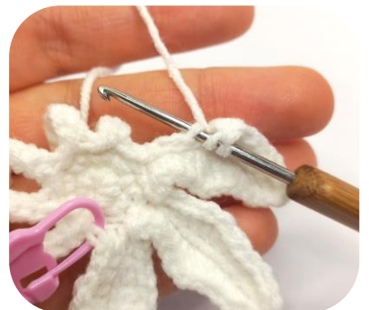
R 04 : 2 nd side on the BLO of the slip stitches