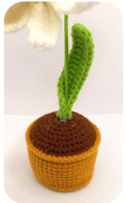
Use glue to attach the leaf to the stem