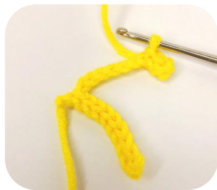
Second set on 9 slst