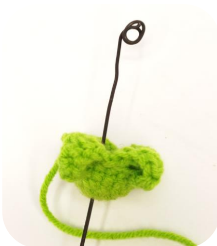
Inserting the wire