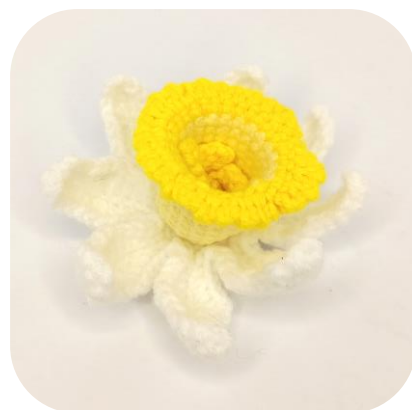
Sewing the corona on top of the petals