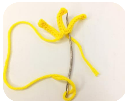
Sewing the ends