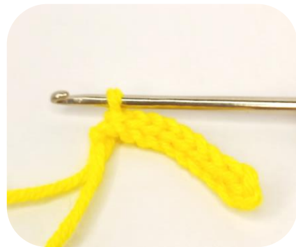
First set on 9 slst

Cut the yarn leaving a long end for sewing. Sew the beginning and the end of the stamen together with the yarn left. Don't cut the yarn left you will use it later for sewing.