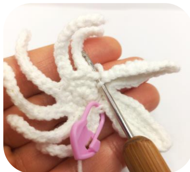
R 04 : 1 slst in the next st on the circle