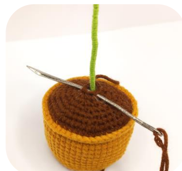
Closing the opening