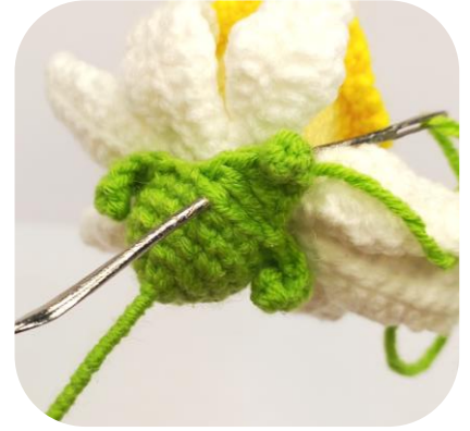
Sewing the flower on the rosehip