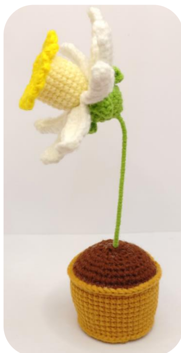
Before and after bending the wire